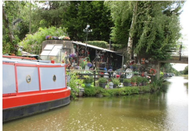
View of an interesting canal side garden

the fish and chip shop's website that Jim had then accessed, ended up causing considerable consternation for those trying to organise the finances!