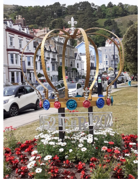
Tribute to the Queen for her Platinum Jubilee