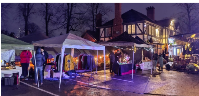
Some of the stalls at the festive event

Inclement weather on Saturday did not deter many of our members from supporting this annual festive evening which was held at the Flower Pot. Stallholders perhaps did not receive the sales and attention that they were hoping for as the rain meant that many attendees sheltered inside. However, hog roast sales went well and the writer's husband was certainly pleased he was there early enough to indulge in something he'd looked forward to all day!