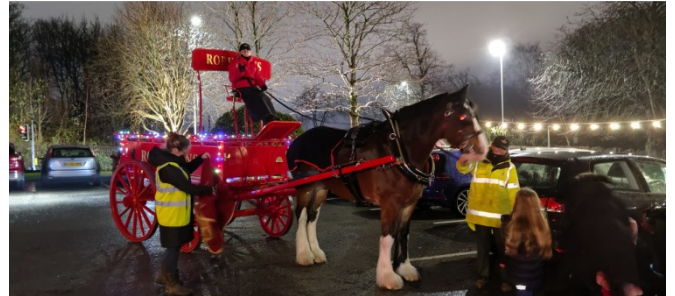
Robinsons Shire horse Mojo and cart

The Robinsons Shire horse and cart proved a bit hit and attracted attention from both young and old. Many of the younger attendees were pleased to be able to stroke the horse and to chat with the Robinsons staff who accompanied the cart.